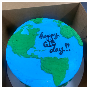
Top Left: We attended ILGISA 2022